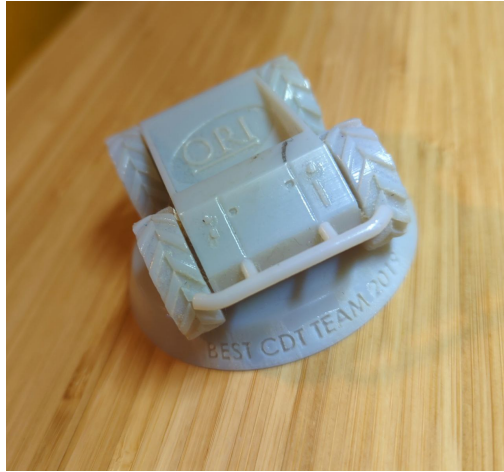
Famous hackathon prize.